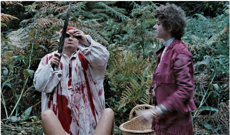
Figure 5: The covert terrorism of the bourgeoisie will lead to the even greater and brutal terrorism of the FLSO extremist hippies.