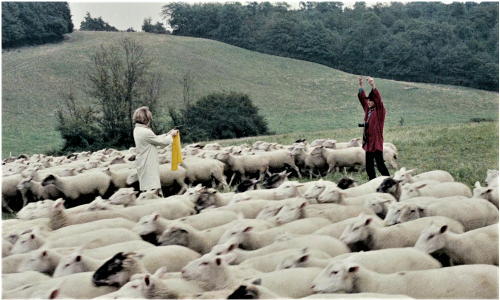
Figure 4: The "L'ange Exterminateur" scene, in its obvious surrealist style, ends paying tribute to Luis Buñuel.

Joseph Balsamo 6 (Balsam), a flamboyant version of Jesus in holy anger, "proclaims in our modern times the end of conventionality and the beginning of the blossoming of every field, especially cinema". 7