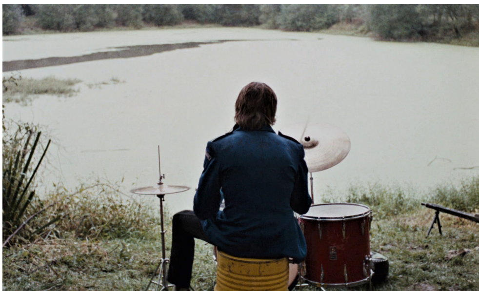
Figure 1: Lautréamont's poem Les Chants de Maldoror recited off screen by Kalfon at the beat of the drums.

In a remarkable, often combined Brechtian surrealist manner, Week-end evolves around themes that could be codified as follows: deconstructing Parisian couple/family, greed and belligerence, from sexual abuse of bodies to murderous uses, social prostitution and class struggle, from murderous accidents to deliberate killings, from hyper-consumerism to the commodification of people, from civilization and its disappointments to totem and taboo, from every day violence to terrorism.