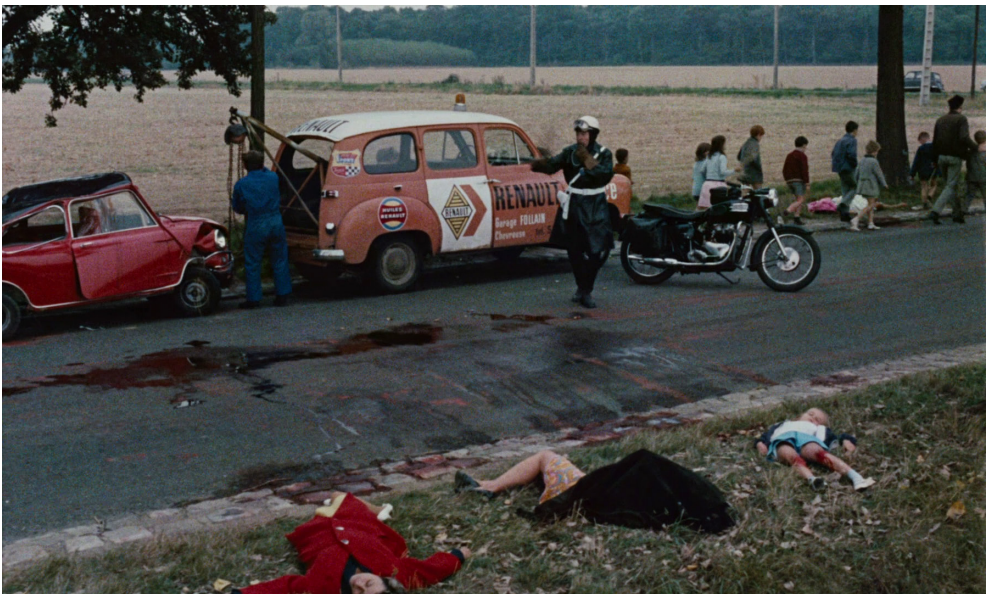
Figure 3: The most comically grotesque scene in the history of cinema unfolds.

The adventure has just started. The titles “Week-end” and “Saturday 11 am” alternate fast twice and perhaps the most comically grotesque scene in the history of cinema unfolds! A very slow tracking shot to the right (lasting 7½ minutes and intermittently interrupted) watches Facel as Roland (with Corinne as co-driver) nervously drives it on a provincial road that has been barred, to stop inevitably next to an endless series of stopped cars. The shot exposes an unparalleled wealth of visual and aural indices in surre-al interaction! There is a continuing cacophony of horns, while we see in a series: two men playing cards on the roof of a black car, a couple playing chess on the pavement, a man playing ball with a child emerging from the open sky of another car, a group of children shouting along the street, a wrecked car turned over, a wandering circus, monkeys, lions, a sailboat raising sails –and the scene becomes more and more surreal. Roland tries to move on while the others are shouting and gesturing at him. The road continues to reveal goods of all sorts, a yacht on a sailboat trailer and people in line as commodities dealing with all sorts of things while they are waiting. Eventually, the traveling shot reveals the cause of the blockage: a multiple car crash, dead bodies on the road, deformed cars, blood on the asphalt.